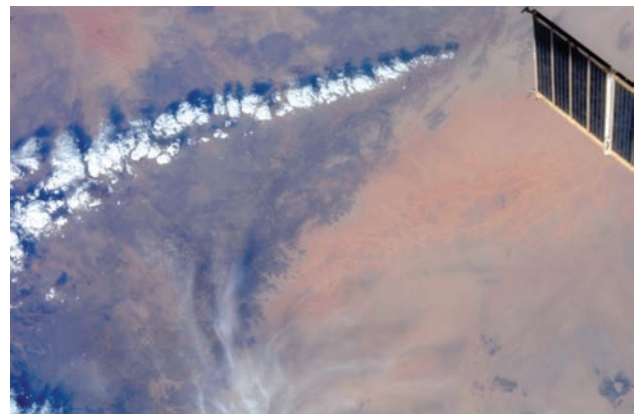
Fig. 6. “Live” fault of the platform part of the African continent, recorded by a powerful cloud lineament.