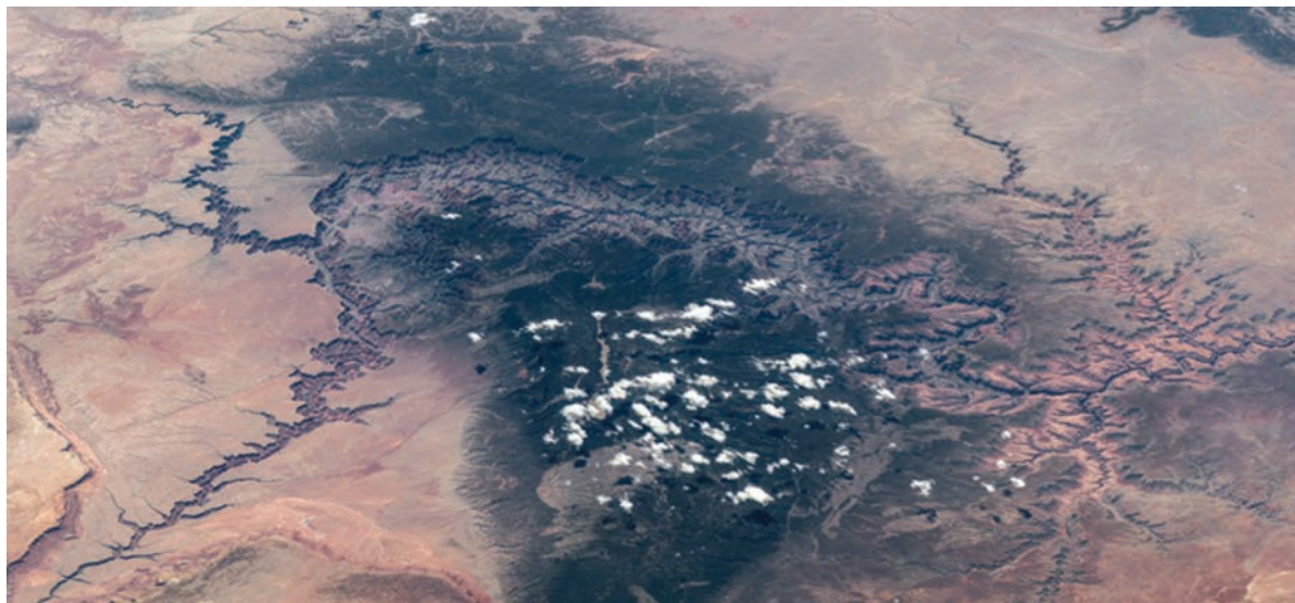
Fig. 1. Linear cloud chains over activated large faults in the Arizona desert, USA. By the location of the clouds, it can be judged that at the time of the survey, a large structural node for crossing the faults was activated here. The image was taken from the international space station, from an altitude of 400 km from the Italian surveillance module “Dome” (2016). Photo: Jeff Williams, NASA. https://www.instagram.com/astro_jeffw/?hl=en

1 – linear chains, ridges and stripes of clouds against the background of cloudless space are concentrated and oriented along the strike of deep fault zones or their fragments (Fig. 1-3);