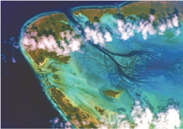
Fig. 4. Chains of clouds over activated faults. Aldabra Island (Seychelles) is an atoll in the Indian Ocean. At the base of the second largest atoll in the world is the crater of an extinct volcano. Photo published 24.10.2017. It was made from the international space station from the Italian observation module “Dome” from an altitude of 400 km.