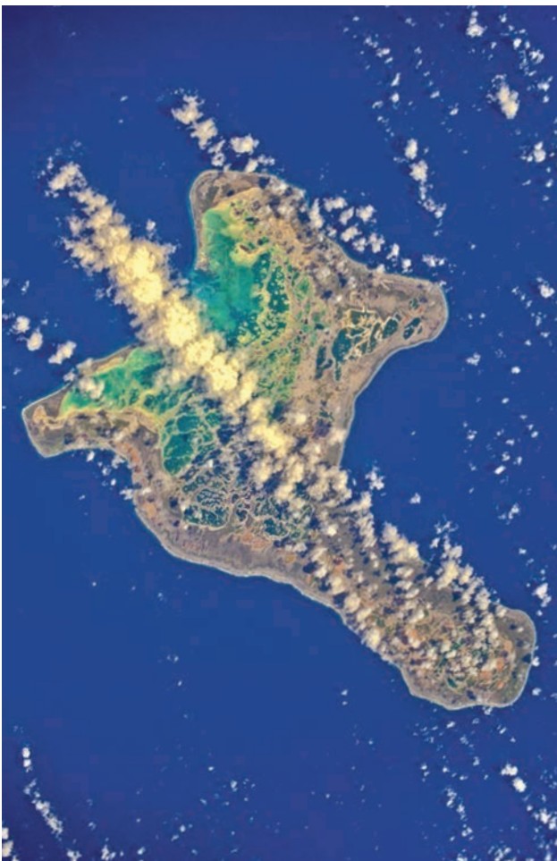
Fig. 5. Subparallel chains of clouds above the “living” faults of the land and the sea. Christmas Island (Kiribati). The largest atoll in the world with an area of 21 km 2 . Altitude – 13 m. The photo was taken at the end of 2017 from the ISS. Photo by Sergey Ryazansky. https://fishki.net/-ostrov-rozhdestva-kiribati-photo.htm