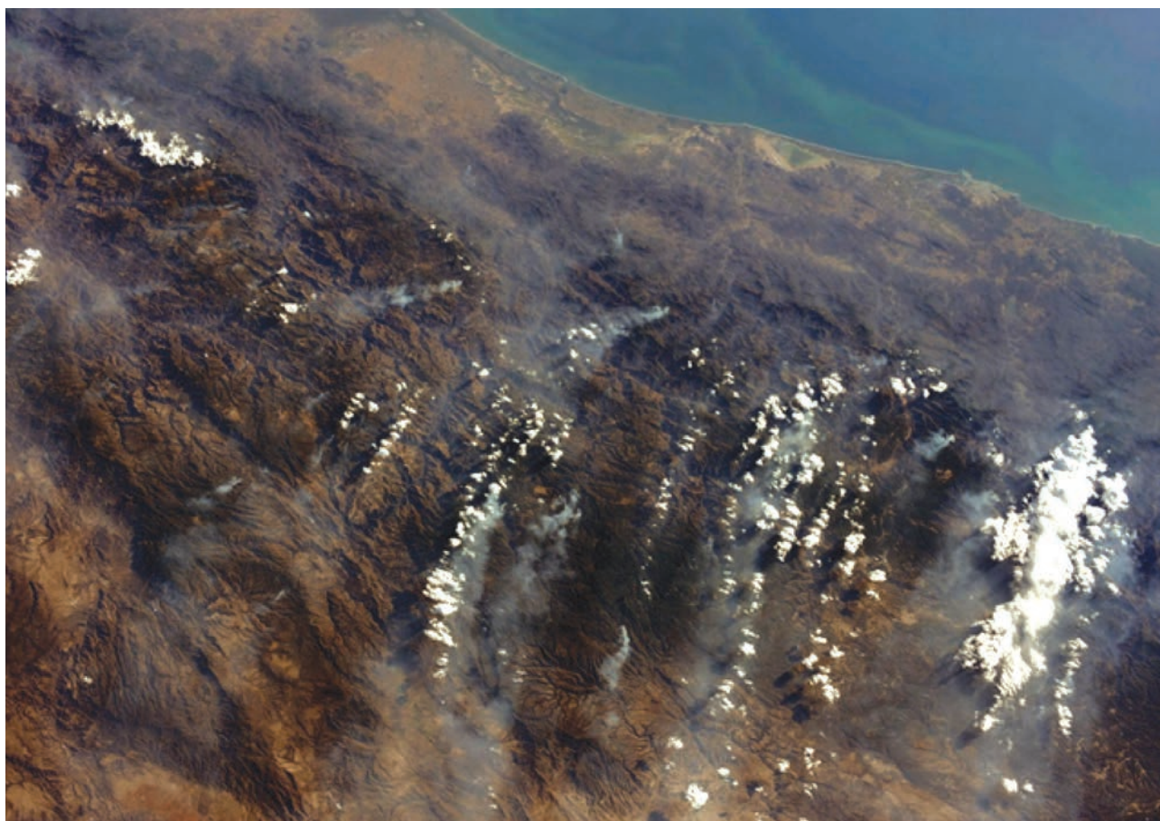
Fig. 7. Cloud chains over numerous geodynamically active fault zones in the mountain-folded region of our planet.

5 – the length of cloud lineaments in the atmosphere usually reaches hundreds, sometimes thousands of kilometers, and the width is up to the first tens of kilometers. Cloud anomalies in the atmosphere are recorded at altitudes from 1 to 20 km. The discovery of cloudy “autographs” of deep-seated earth faults at high altitudes undoubtedly indicates a significant influence of deep tectonics and geodynamics on the atmosphere of planet Earth. It is also obvious that the clouds, with changing geodynamic and energy conditions in the tectonosphere of the planet, move fairly quickly both relative to deep faults and relative to the earth’s surface as a whole. Consequently, their cloudy “autographs” previously formed over deep faults in this case quickly disappear. In some cases, on the same satellite image above different faults or different fragments of the same fault, there are ridges and canyons. Conse-