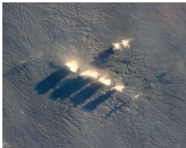
Fig. 3. A chain of clouds and their shadows over the “revived” fault. Photo from the ISS 09/27/2014 Astronaut Gerst noted: “Even clouds sometimes like to stand out”. Photo: Alexander Gerst / ESA / NASA. https://alexandergerst.esa.int/

1 – linear elements of cloud cover in satellite images stand out above all activated ones, i.e. “ living ” deep fault zones (or their fragments) of the orthogonal (along meridians and latitudes) and diag-